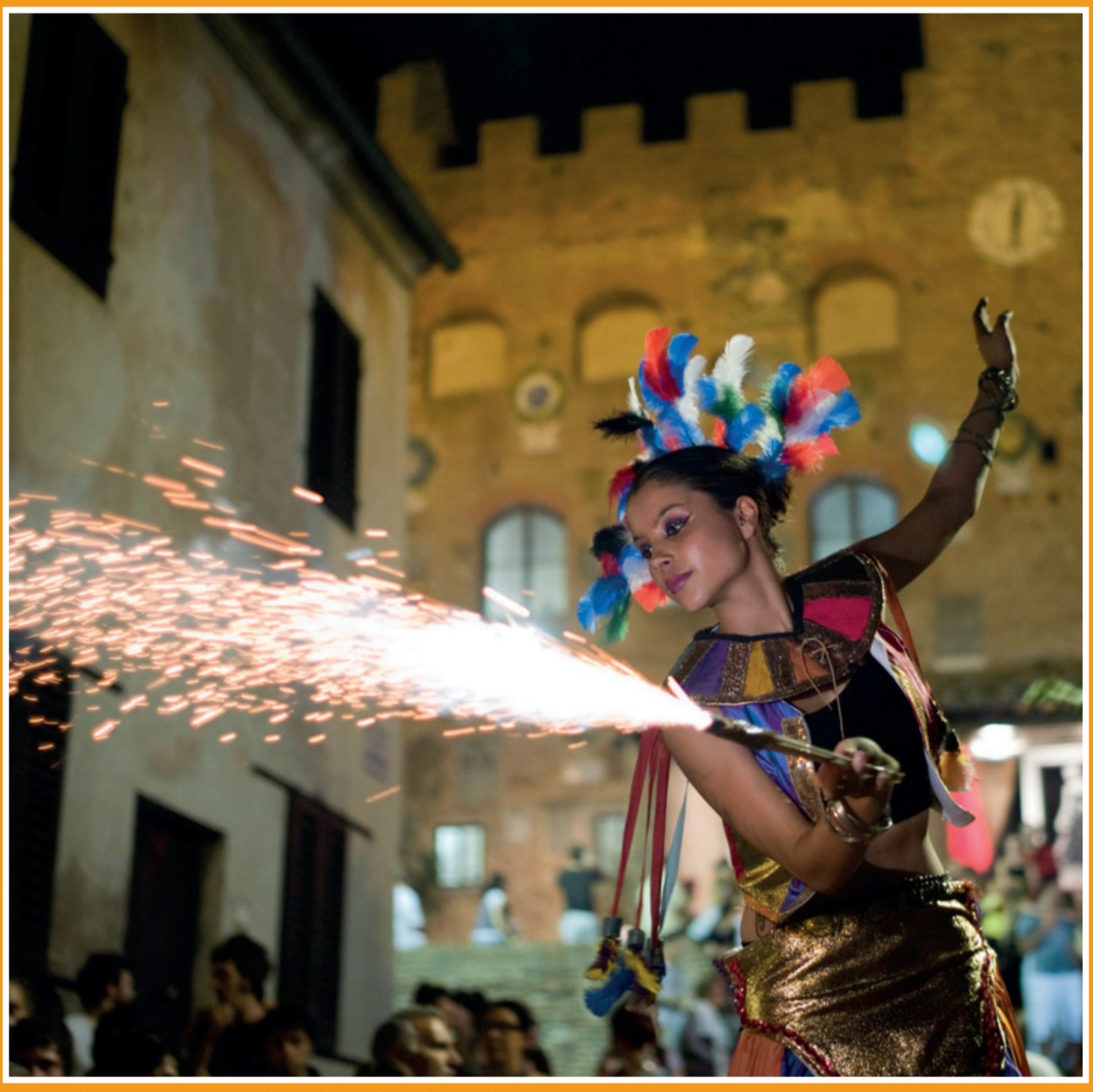
CERTALDO | "Mercantia" International street theatre festival, 14-18 July 2010